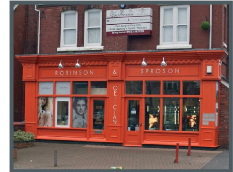
Robinson & Sproson - professional eye care