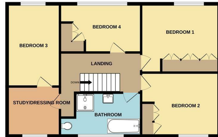
TOTAL FLOOR AREA : 1674 sq.ft. (155.5 sq.m.) approx.

Whilst every attempt has been made to ensure the accuracy of the floorplan contained here, measurements of doors, windows, rooms and any other items are approximate and no responsibility is taken for any error, omission or mis-statement. This plan is for illustrative purposes only and should be used as such by any prospective purchaser. The services, systems and appliances shown have not been tested and no guarantee as to their operability or efficiency can be given. Made with Metropix ©2024