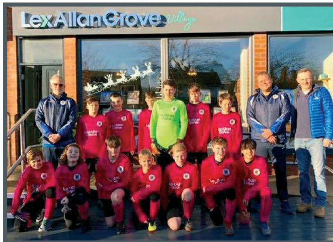
West Hagley Football Club Under 13s in their new Lex Allan Grove Village shirts