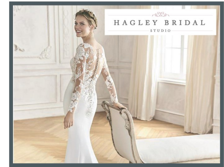
Hagley Bridal Studio - exceptional service