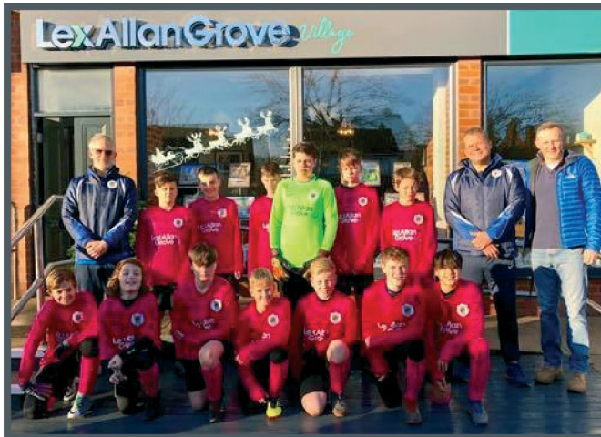
West Hagley Football Club Under 13s in their new Lex Allan Grove Village shirts