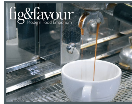
fig & favour - modern food emporium