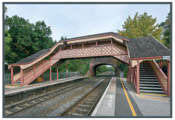
Hagley Train Station