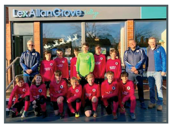
West Hagley Football Club Under 13s in their new Lex Allan Grove Village shirts