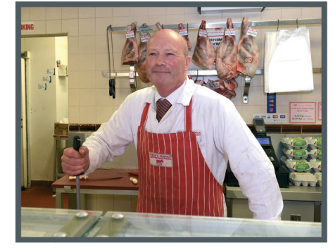
Paddocks - choice cuts from the choice of villagers