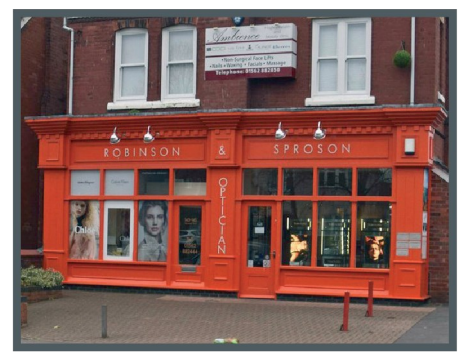
Robinson & Sproson - professional eye care