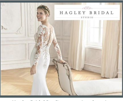
Hagley Bridal Studio - exceptional service