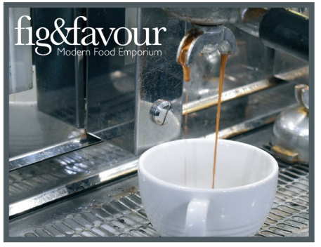
fig & favour - modern food emporium