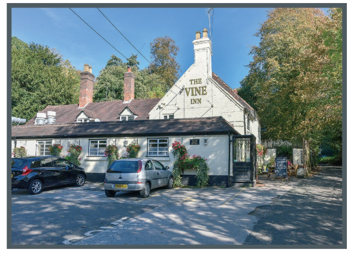
The Vine Inn, Clent - a favourite local haunt