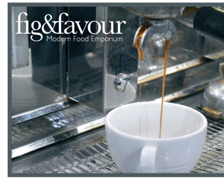
fig & favour - modern food emporium