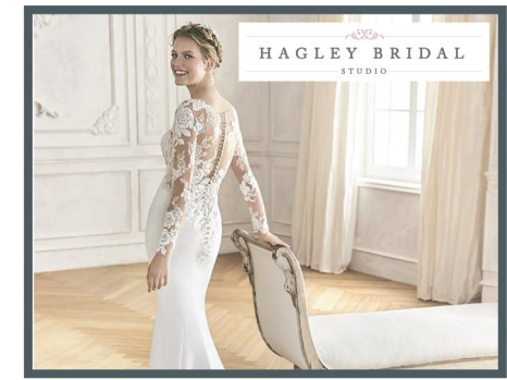
Hagley Bridal Studio - exceptional service