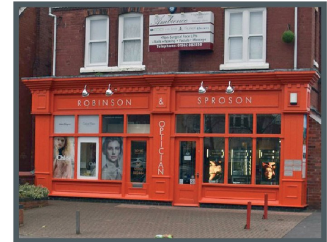
Robinson & Sproson - professional eye care