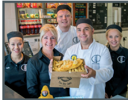
Our Plaiçe - award-winning fish & chips