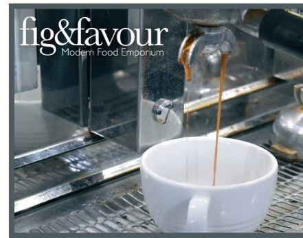
fig & favour - modern food emporium