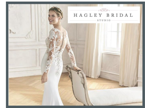
Hagley Bridal Studio - exceptional service