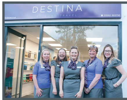
Destina by Good Travel - dedicated travel experts