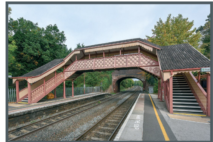
Hagley Train Station