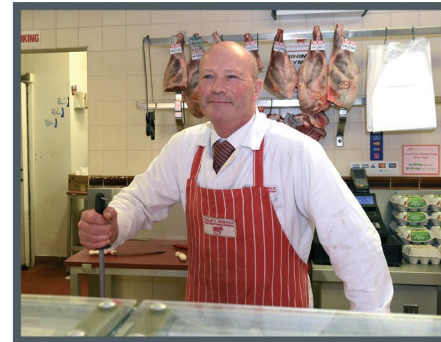
Paddocks - choice cuts from the choice of villagers