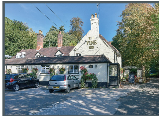
The Vine Inn, Clent - a favourite local haunt