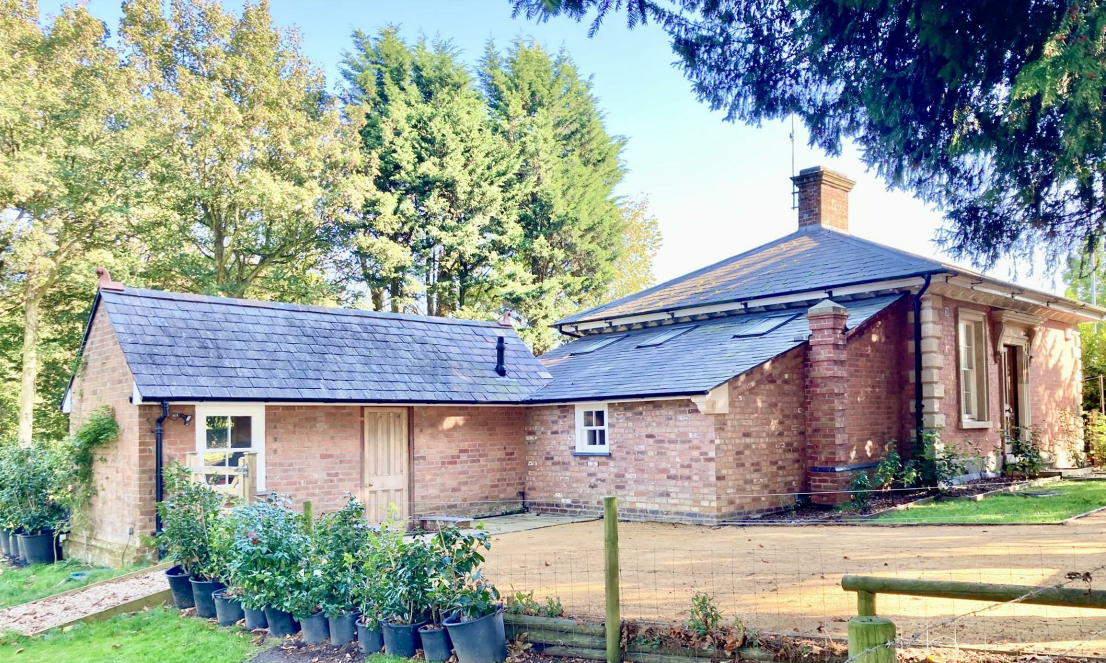
Chepstow Lodge , Highnam, GL2 8DF