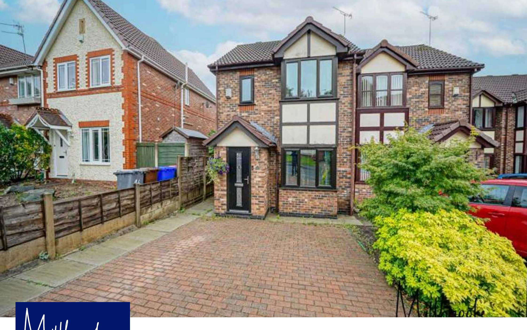
44 Border Brook Lane, Worsley £270,000