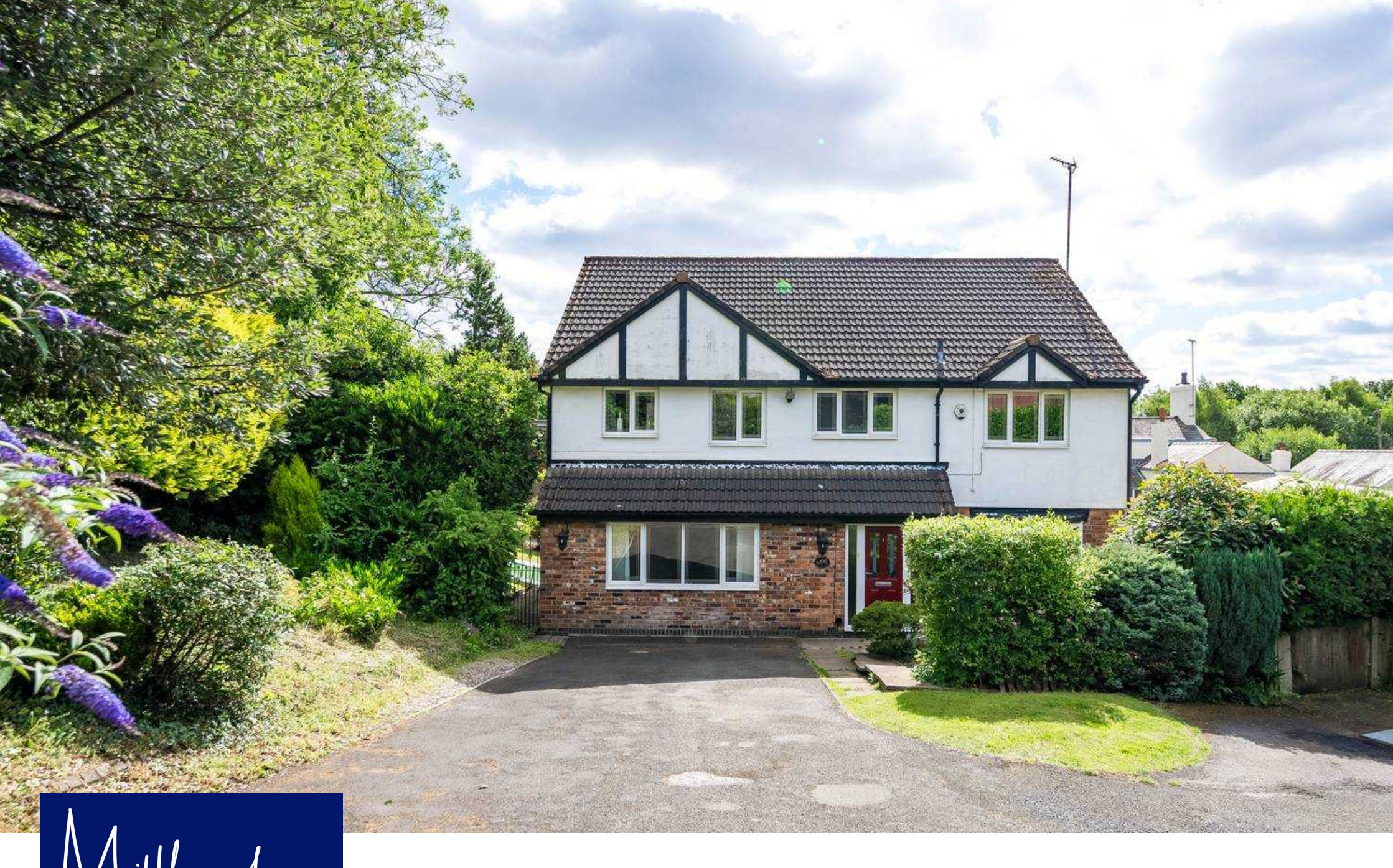
1 Falconwood Chase, Worsley £725,000