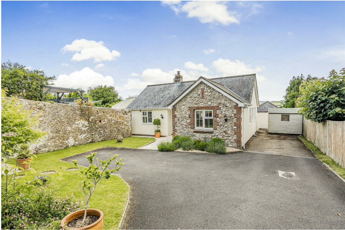
AN ATTRACTIVE AND INDIVIDUAL DETACHED BUNGALOW, SITUATED WITHIN THE POPULAR VILLAGE OF MUSBURY