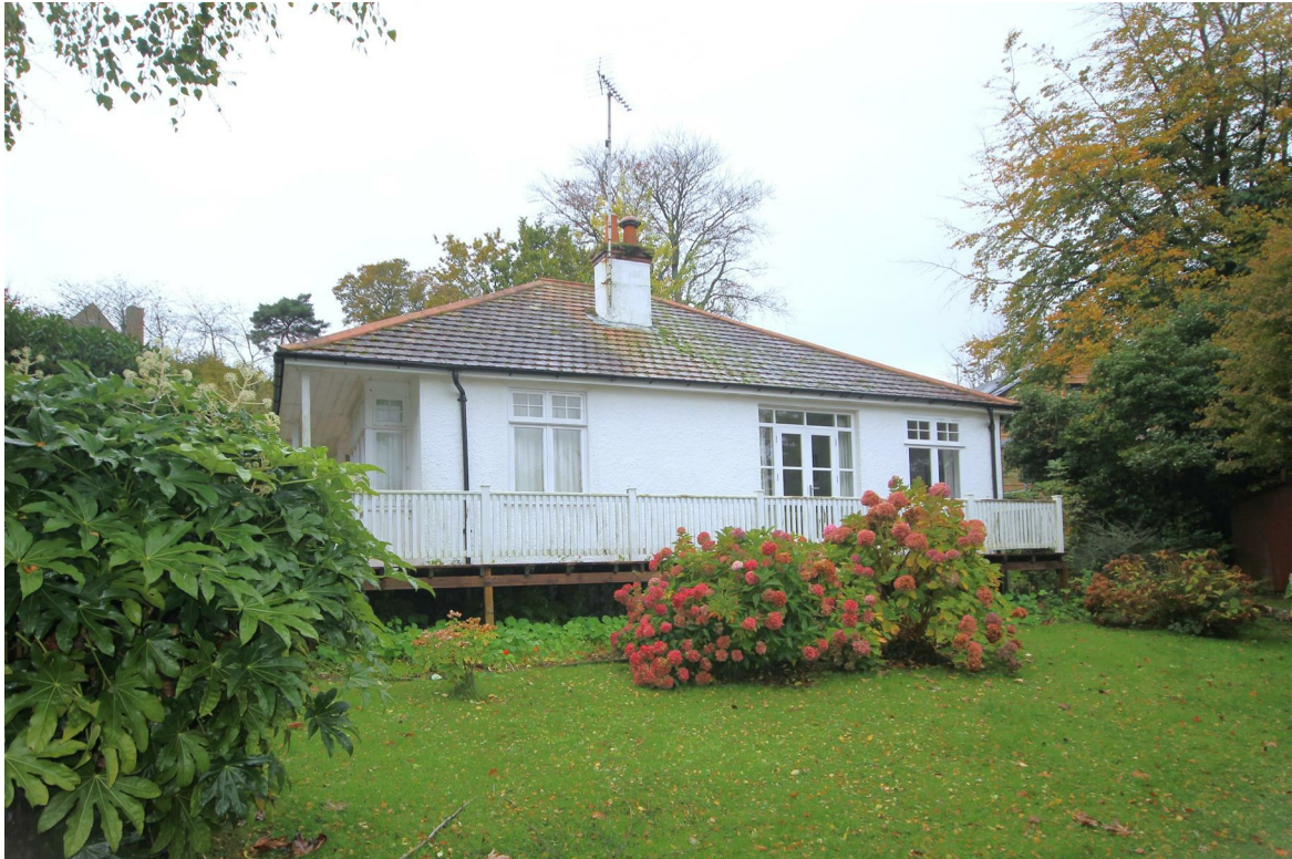
A 1920S/30S DETACHED BUNGALOW, INCLUDING MANY CHARACTER FEATURES AND SET WITHIN GENEROUS GARDENS. IN NEED OF UPDATING.