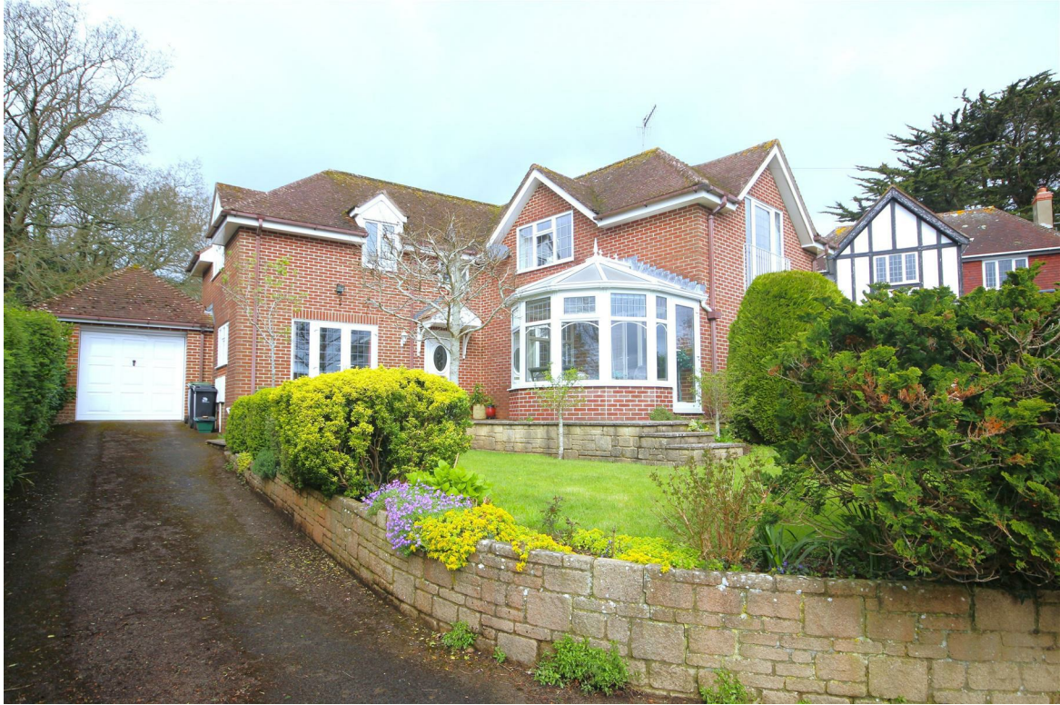
A WELL APPOINTED AND STRIKING DETACHED HOUSE, SITUATED WITHIN EASY REACH OF LYME REGIS TOWN CENTRE AND SEAFRONT