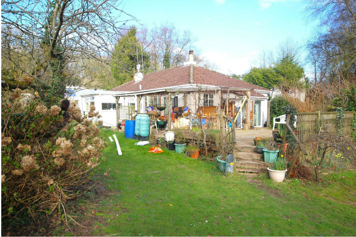
A DETACHED BUNGALOW SITED WITHIN 1.25 ACRES, IN THE POPULAR AREA OF RAYMONDS HILL. POSSIBLE DEVELOPMENT POTENTIAL.