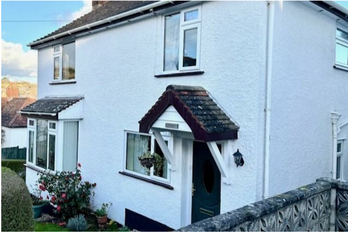
A 1930S/40S DETACHED HOUSE SITUATED WITHIN CLOSE WALKING DISTANCE OF LYME REGIS TOWN CENTRE. REQUIRING MODERNISATION.