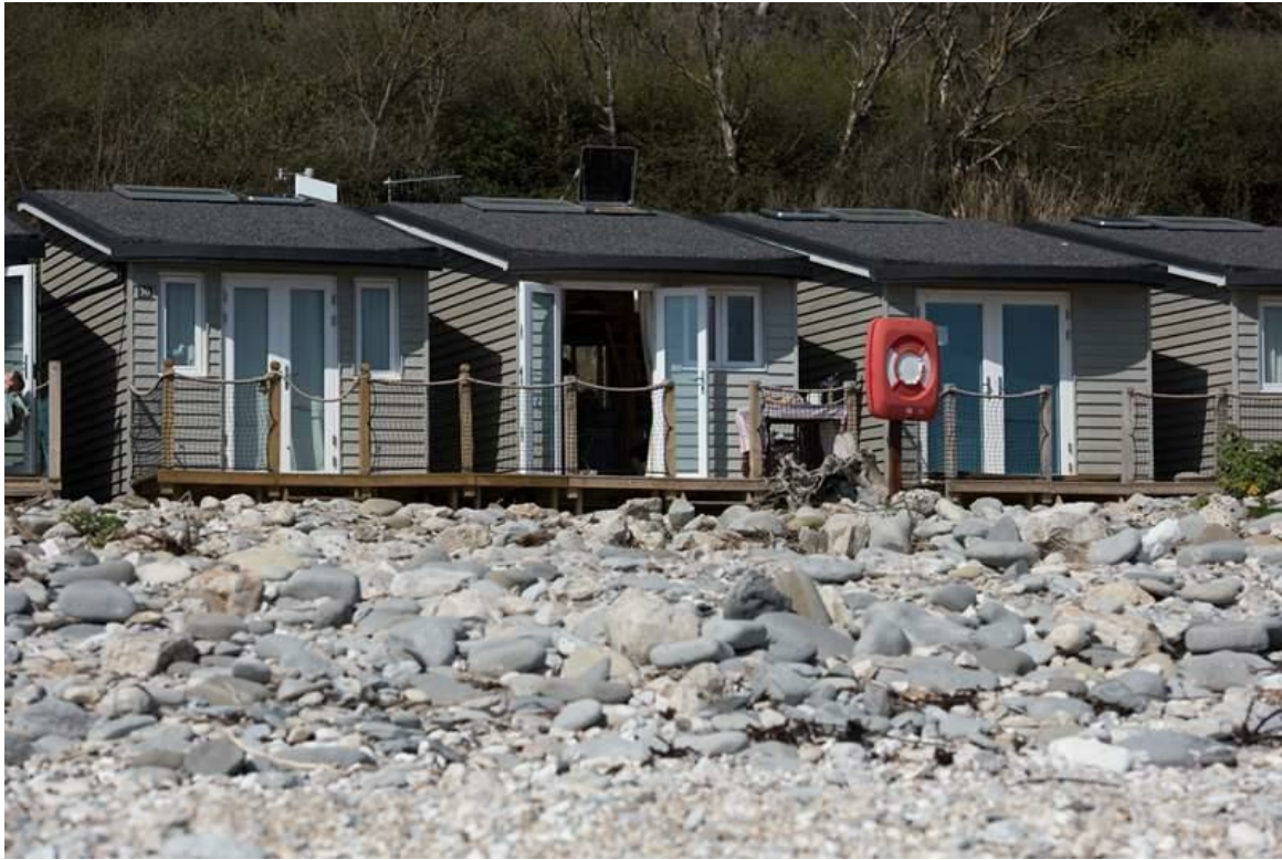
A BEAUTIFULLY PRESENTED BEACH CHALET SITUATED ON MONMOUTH BEACH