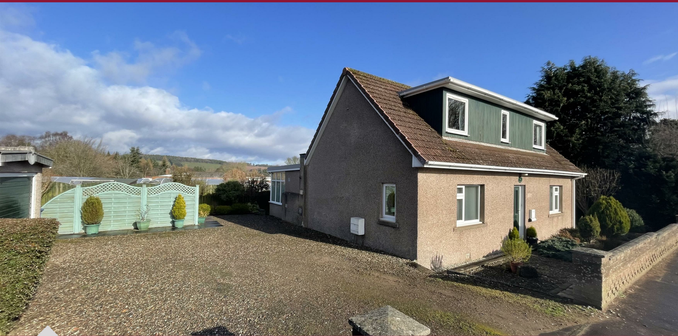
Cairn Cottage Carslogie Road, Cupar, KY15 4HY Offers Over £230,000