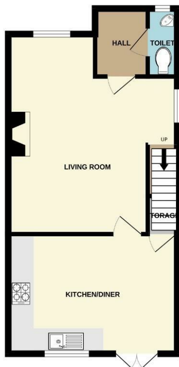
GROUND FLOOR 438 sq.ft. (40.7 sq.m.) approx.