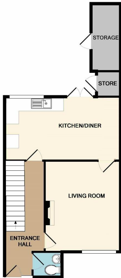
GROUND FLOOR APPROX. FLOOR AREA 534 SQ.FT. (49.6 SQ.M.)