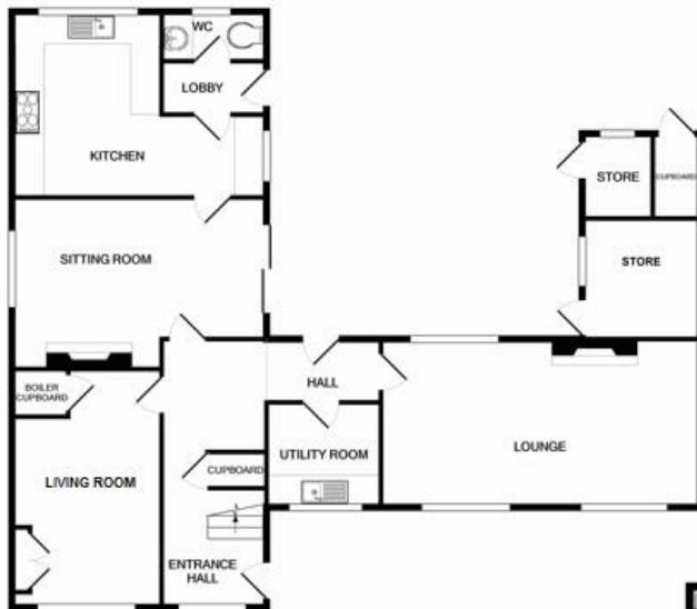
GROUND FLOOR APPROX. FLOOR AREA 1179 SQ.FT. (109.6 SQ.M.)