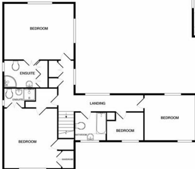
1ST FLOOR APPROX. FLOOR AREA 1064 SQ.FT. (98.9 SQ.M.)