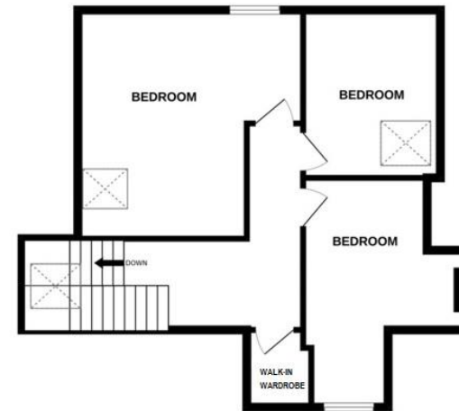
2ND FLOOR 581 sq.ft. (53.9 sq.m.) approx.