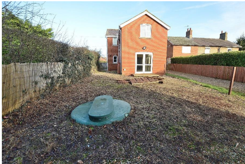
Glencairn, Main Street, Kirkby on Bain

SIZES AND DIMENSIONS ARE APPROXIMATE. WHILE EVERY ATTEMPT TO BE AS FACTUAL AS POSSIBLE HAS BEEN MADE, ACTUAL SIZES MAY VARY. THE POSITION & SIZE OF DOORS, WINDOWS, APPLIANCES AND OTHER FEATURES ARE APPROXIMATE ONLY. Unauthorised reproduction prohibited.