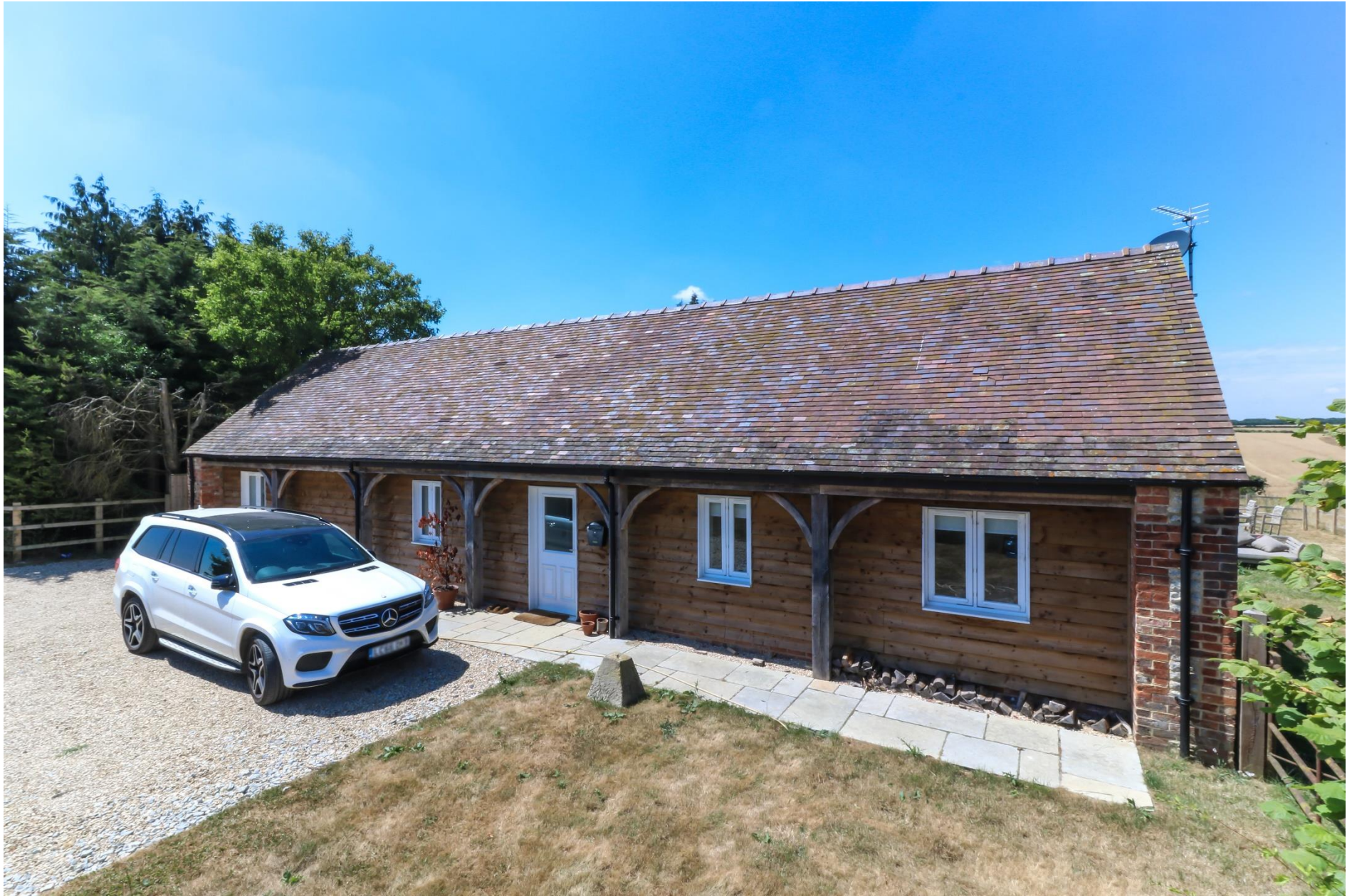
UPPER DORNFORD, WOOTTON, OX20 1AG