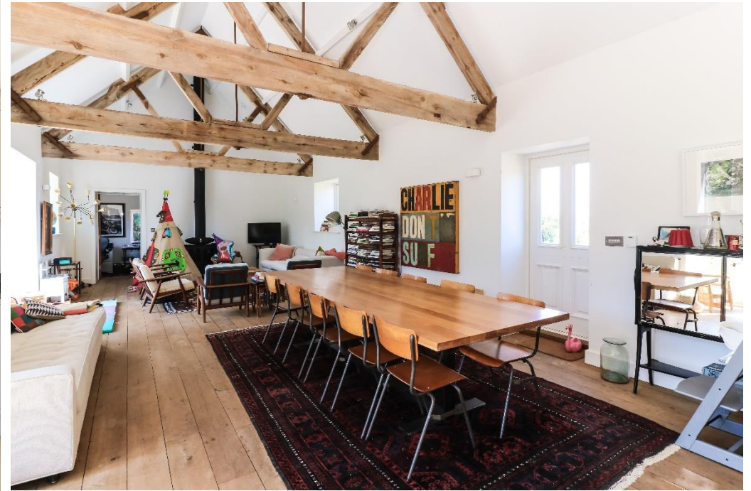
Living Room / Dining Area