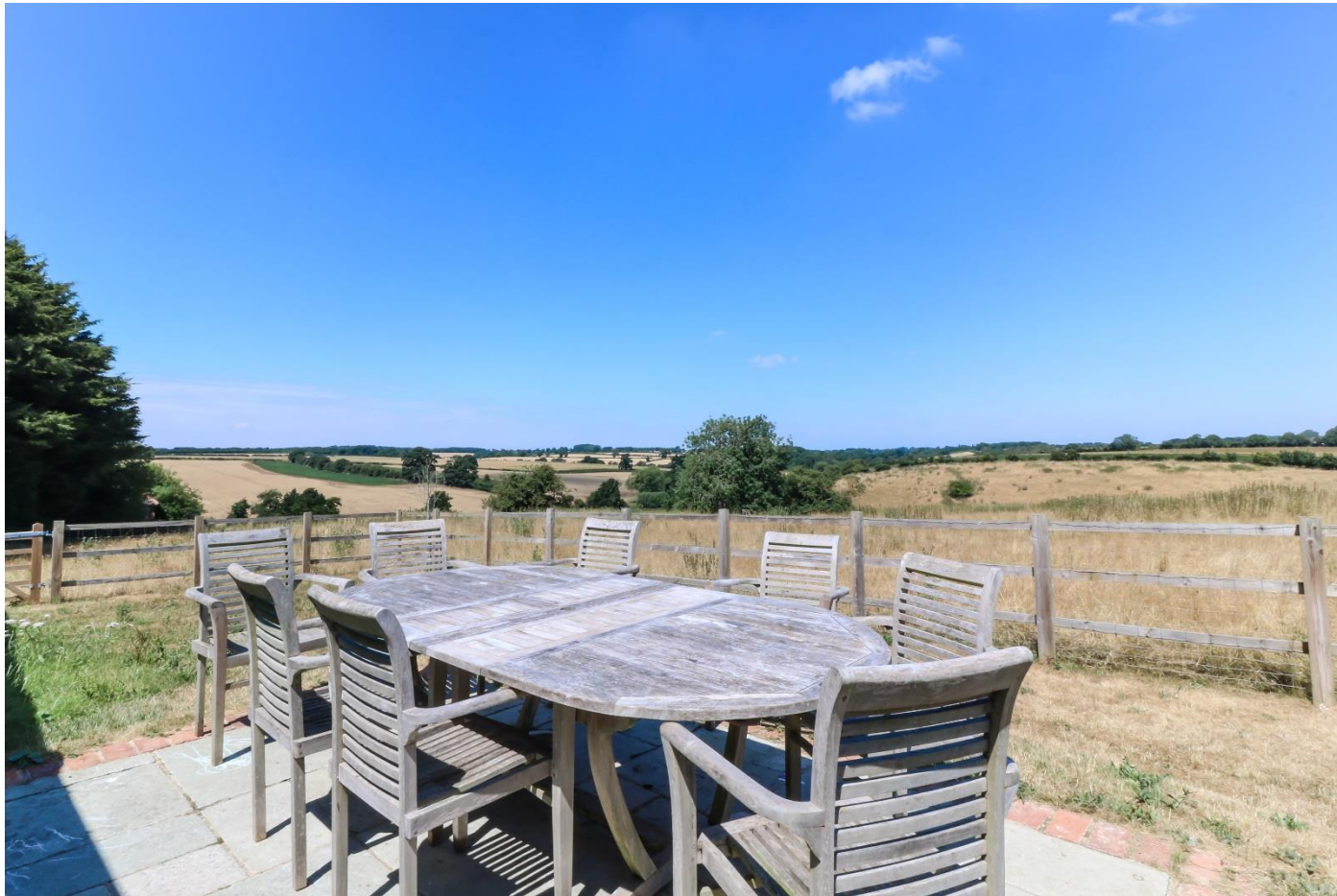
Rear Garden Views

It is within easy reach of Oxford and the A44, A34 and M40 road links. There is also mainline railway stations in the nearby villages of Long Hanborough, Kidlington and Charlbury.