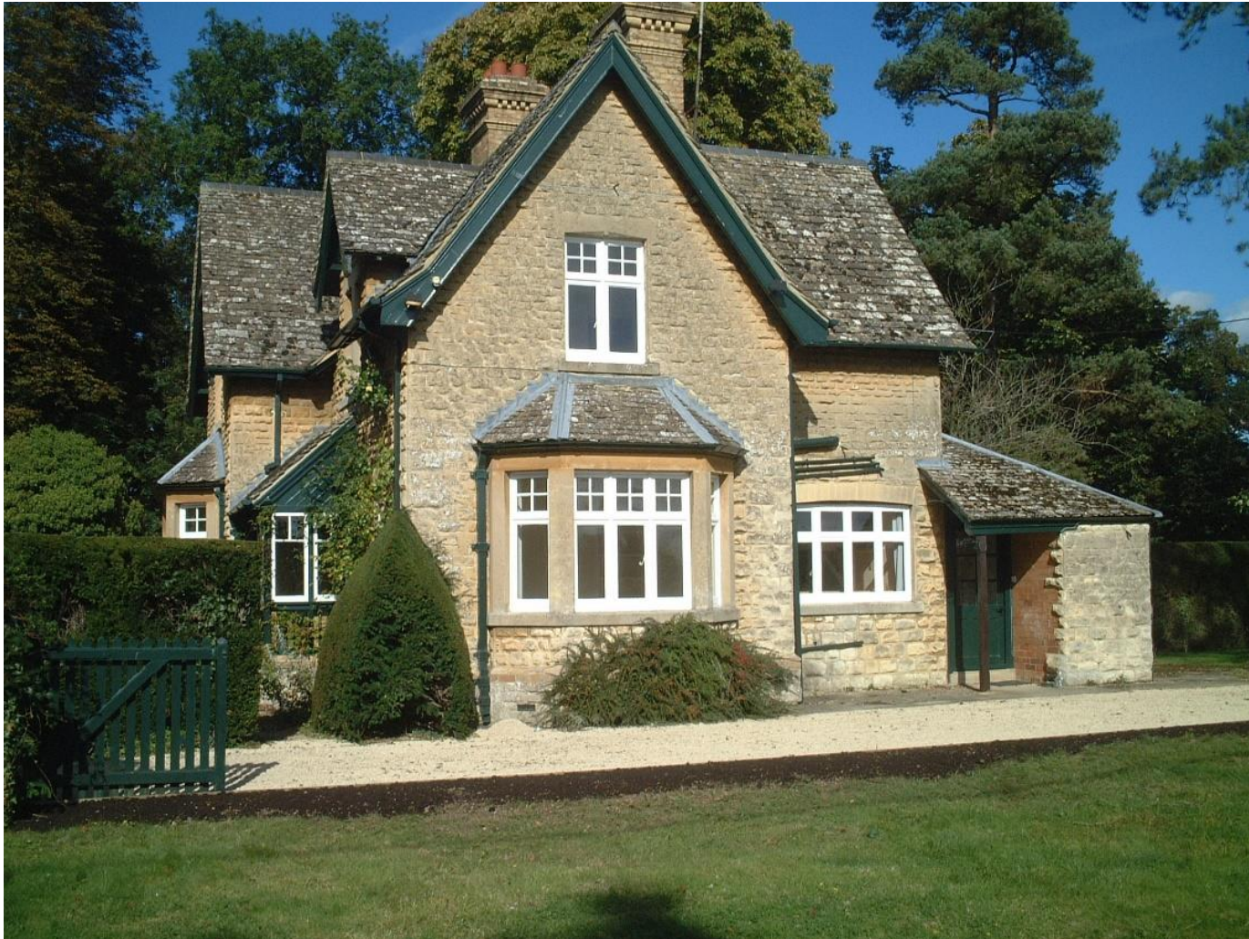
External Side View