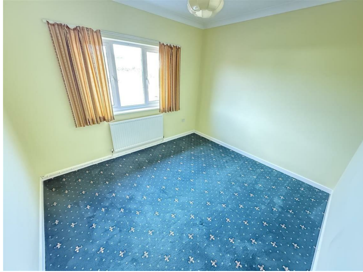
Radiator, front window