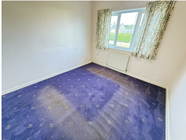
Radiator, front window