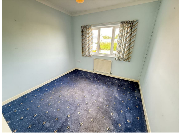
Radiator, front window