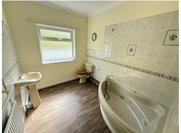
With corner bath, wash hand basin, toilet, part tiled walls, radiator.