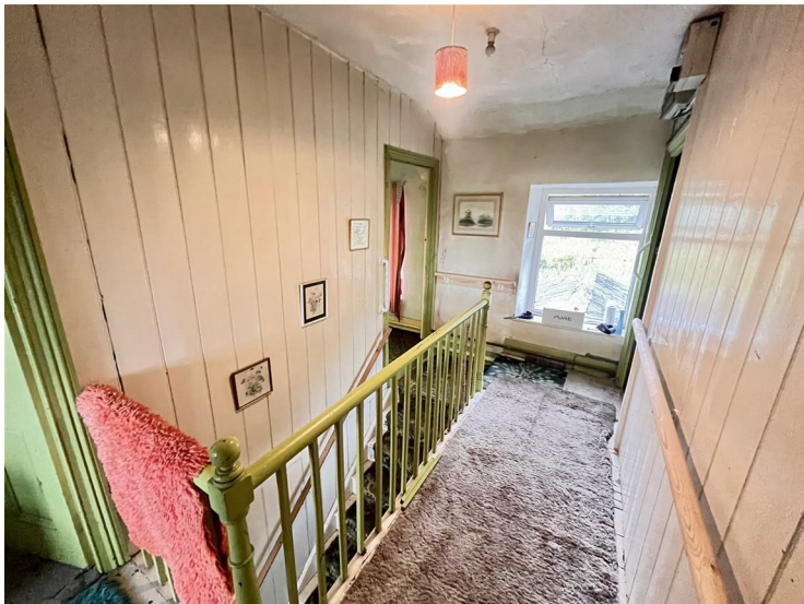
Access to loft, rear window