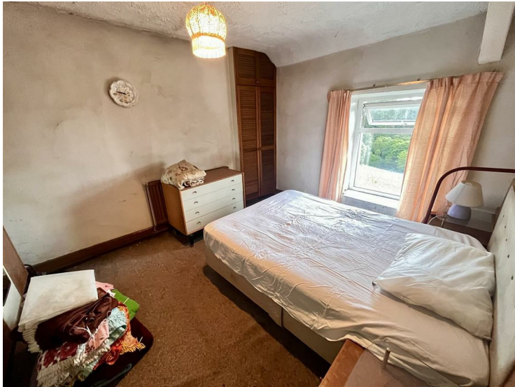
Radiator, front window, built-in cupboards.