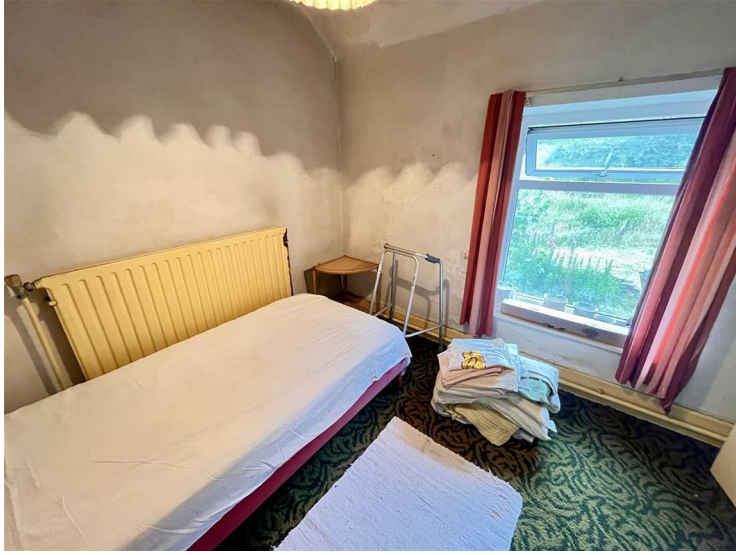
Radiator, front window