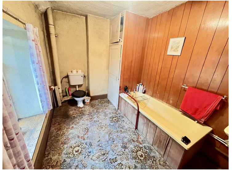
With wash hand basin, toilet and bath, access to airing cupboard with copper cylinder