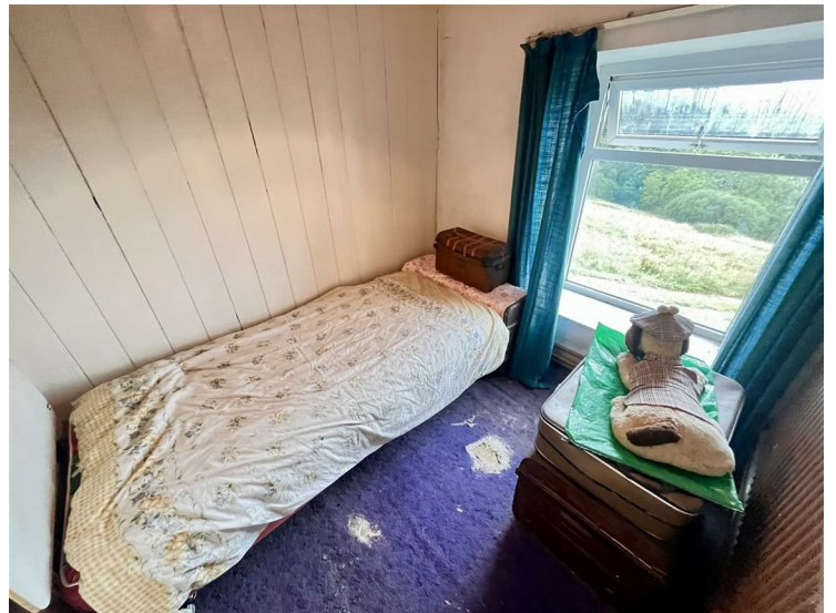
Radiator, front window, tongue and groove walling