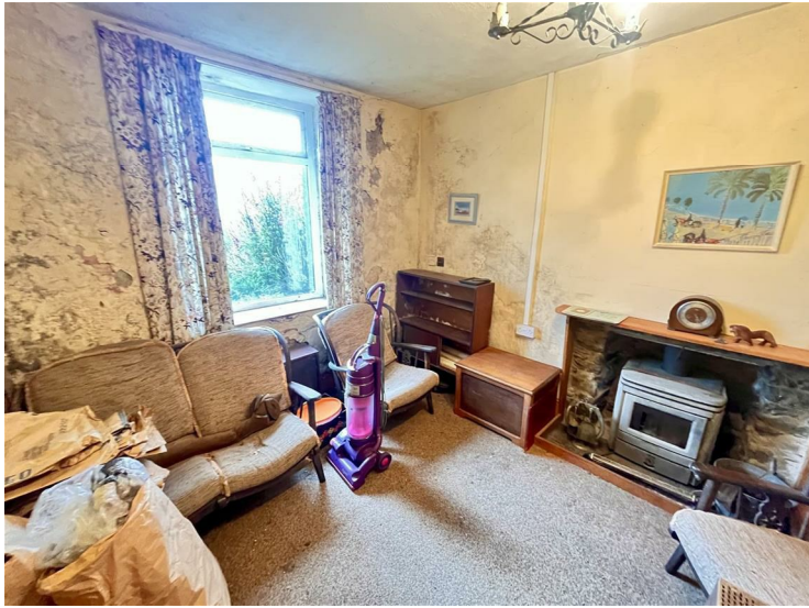
Fireplace with stove. tongue and groove walls