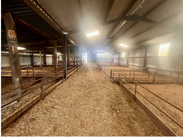
Steel frame sheep/lambing shed with :