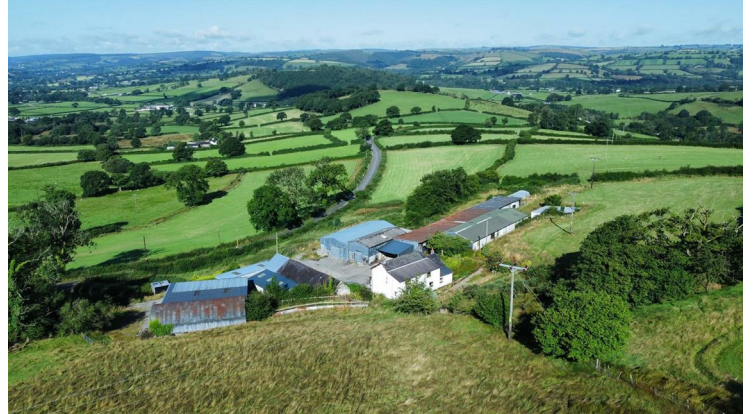
From Lampeter, take the A482 towards Llanwrda, passing through the Village of Pumpsaint, proceed for approximately 2.2 miles and the entrance to Golegoed Uchaf will be on your left hand side with an Evans Bros. Farm For Sale board thereon.