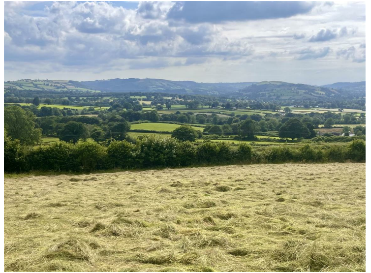
The land is divided onto 3 main enclosure surrounding the homestead offering level to gently sloping fields ideal for livestock or equestrian use.