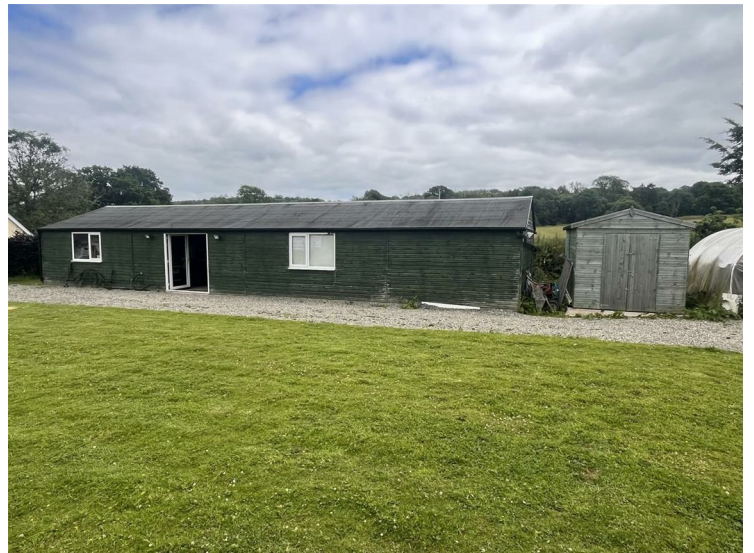
The property has the benefit of a spacious timber built workshop providing spacious accommodation.