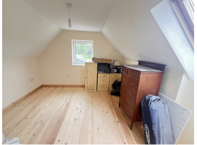
Side window and velux roof window.