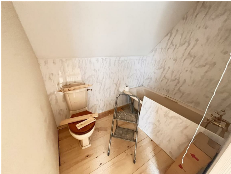
With bath, toilet and wash hand basin