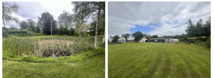
The gardens are extensive lawned gardens with two feature ponds and orchard area.