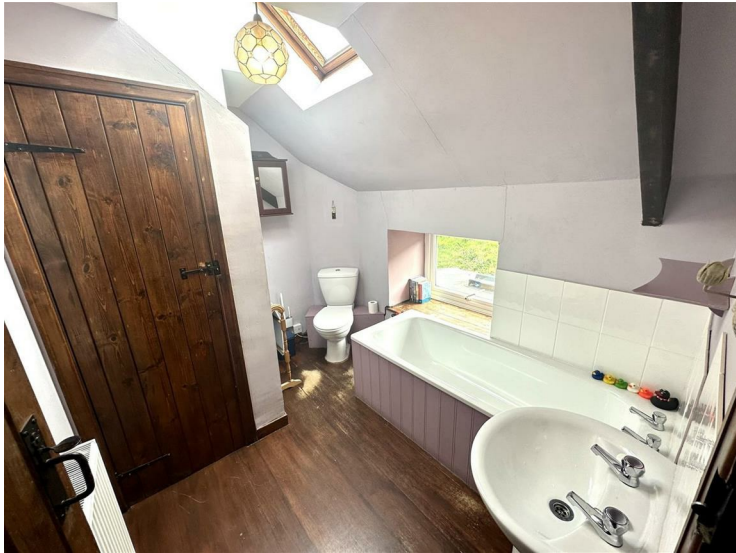
With sky light, radiator, panelled bath, pedestal wash hand basin, toilet, storage cupboard.