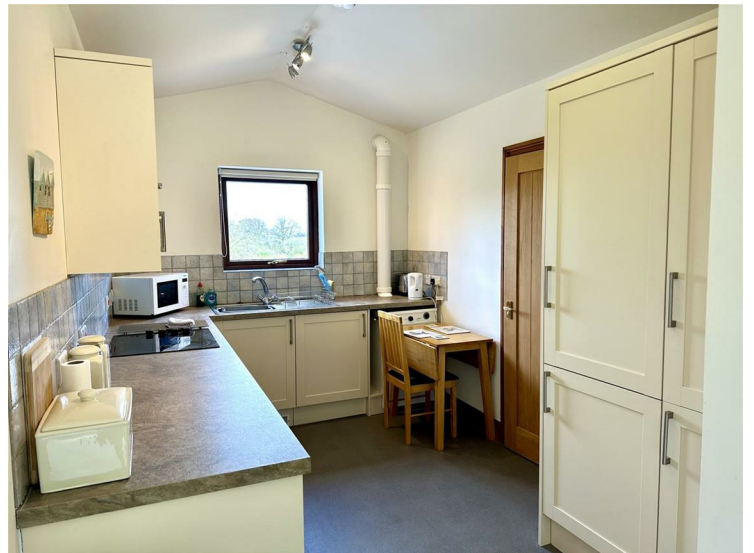
With good quality kitchen units at base and wall level incorporating fitted electric oven, hob with extractor hood over, fitted fridge freezer, single drainer sink unit, fitted washer/drier, oil fired combination boiler