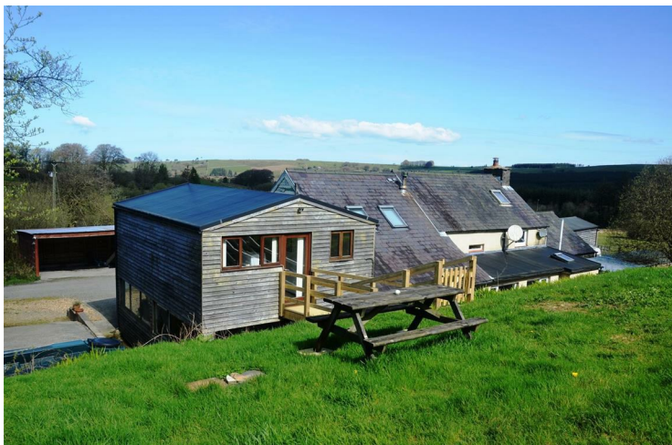
This is self a contained first floor area with independent

access from the front of the property or can be accessed via the initial reception room, having its own independent oil fired heating system and a nice wide staircase with stair lift for less able persons. This has been successfully let as holiday accommodation with returning visitors regularly using it as a rural retreat, or could alternatively be used for multi generational use.