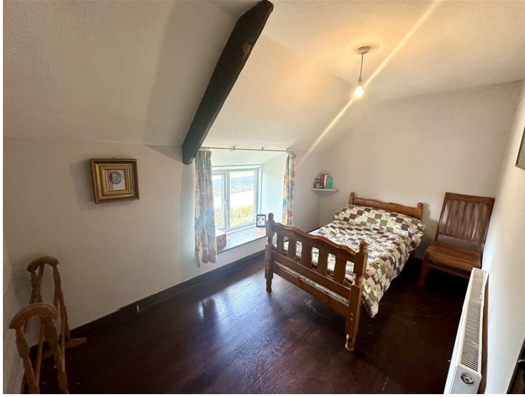
Front window, radiator, stripped pine flooring