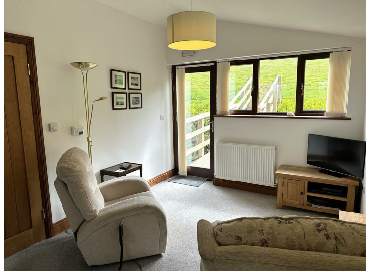
Radiator, door to bridge leading to paddock to the rear, rear window