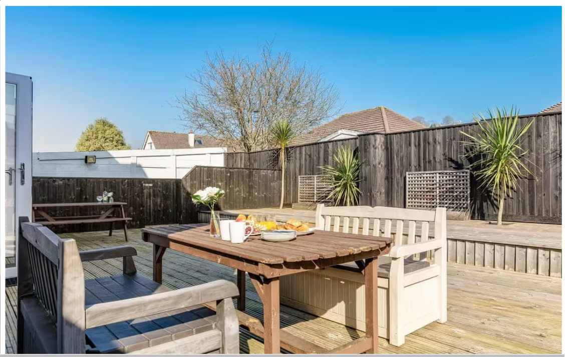
Agents Note: Whilst every care has been taken to prepare these sales particulars, they are for guidance purposes only. All measurements are approximate are for general guidance purposes only and whilst every care has been taken to ensure their accuracy, they should not be relied upon and potential buyers are advised to recheck the measurements before committing to any expense. Floor plans are not to scale. Internal photographs are reproduced for general information and it must not be inferred that any item shown is included in the property. The photographs may only represent part of the property and as they appeared at the time of being taken. No guarantee can be given as to the working condition of any appliances.