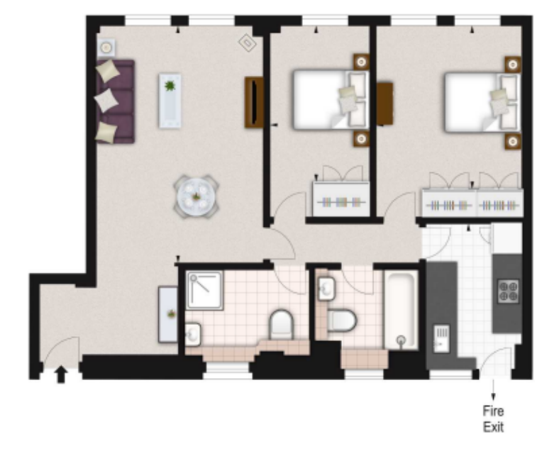
ILLUSTRATION FOR IDENTIFICATION PURPOSES ONLY. NOT TO SCALE * As Defined by RICS - Code of Measuring Practice

APPROX. GROSS INTERNAL AREA * 721 Ft <sup>2</sup> - 66.98 M <sup>2</sup>