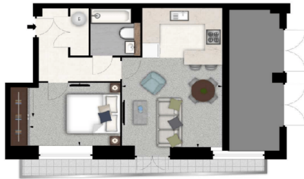
APPROX. GROSS INTERNAL AREA* 541 Ft 2 - 50.26 M 2