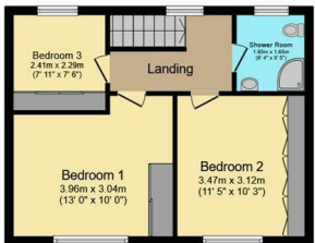
First Floor Floor area 39.9 m 2 (430 sq.ft.)