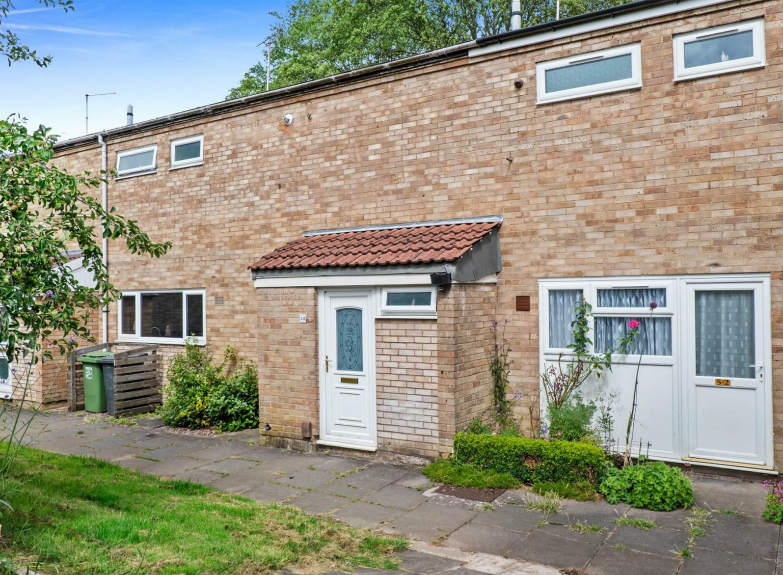
Wishaw Close, Redditch