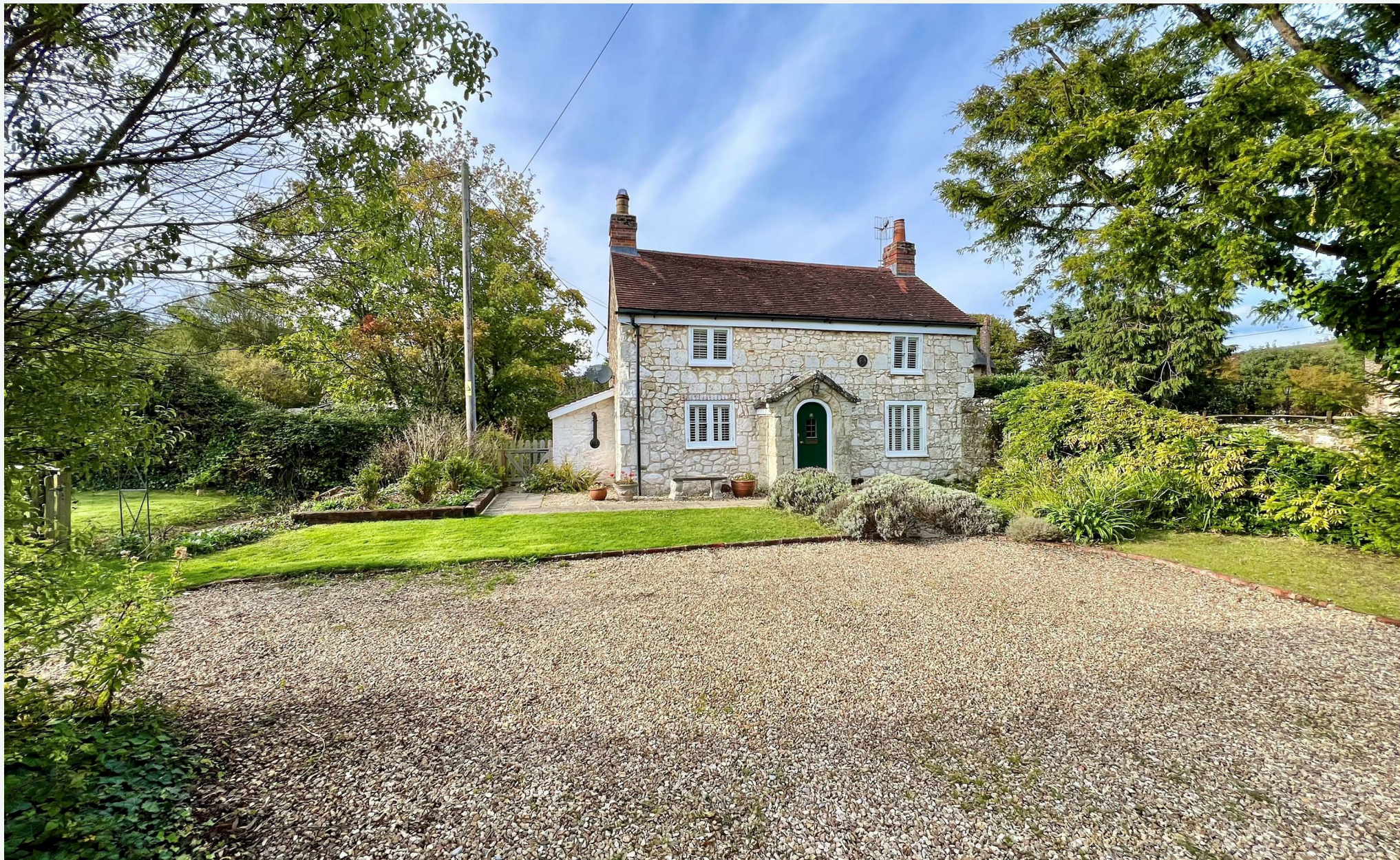
Weirside Cottage, Main Road, Brighstone, Isle of Wight