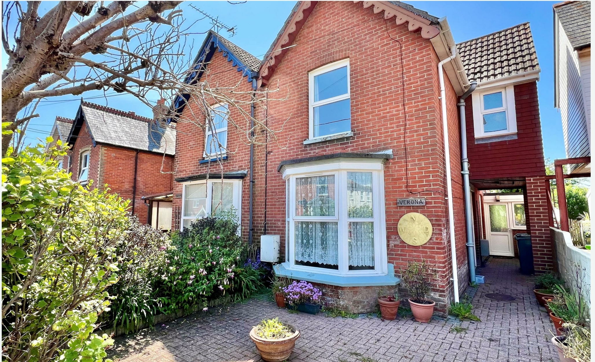
Verona, Princes Road, Freshwater, Isle of Wight