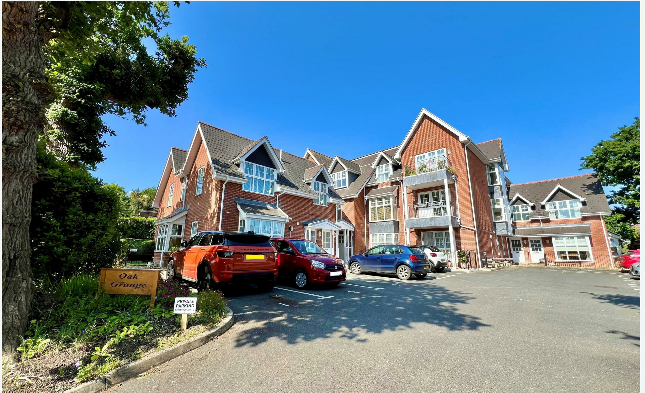
Apartment 9, Oak Grange, Totland Bay, Isle of Wight