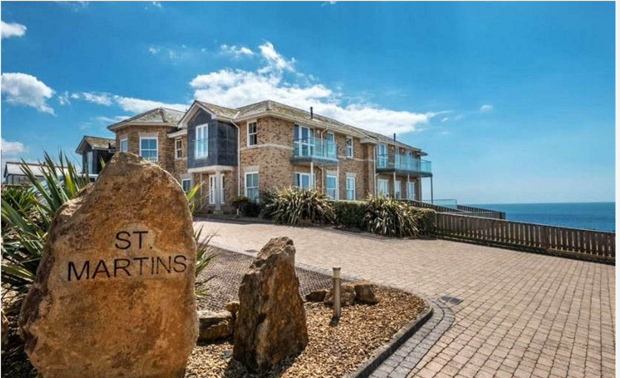
5 St Martins Afton Down, Freshwater Bay, Isle of Wight, PO40 9TY