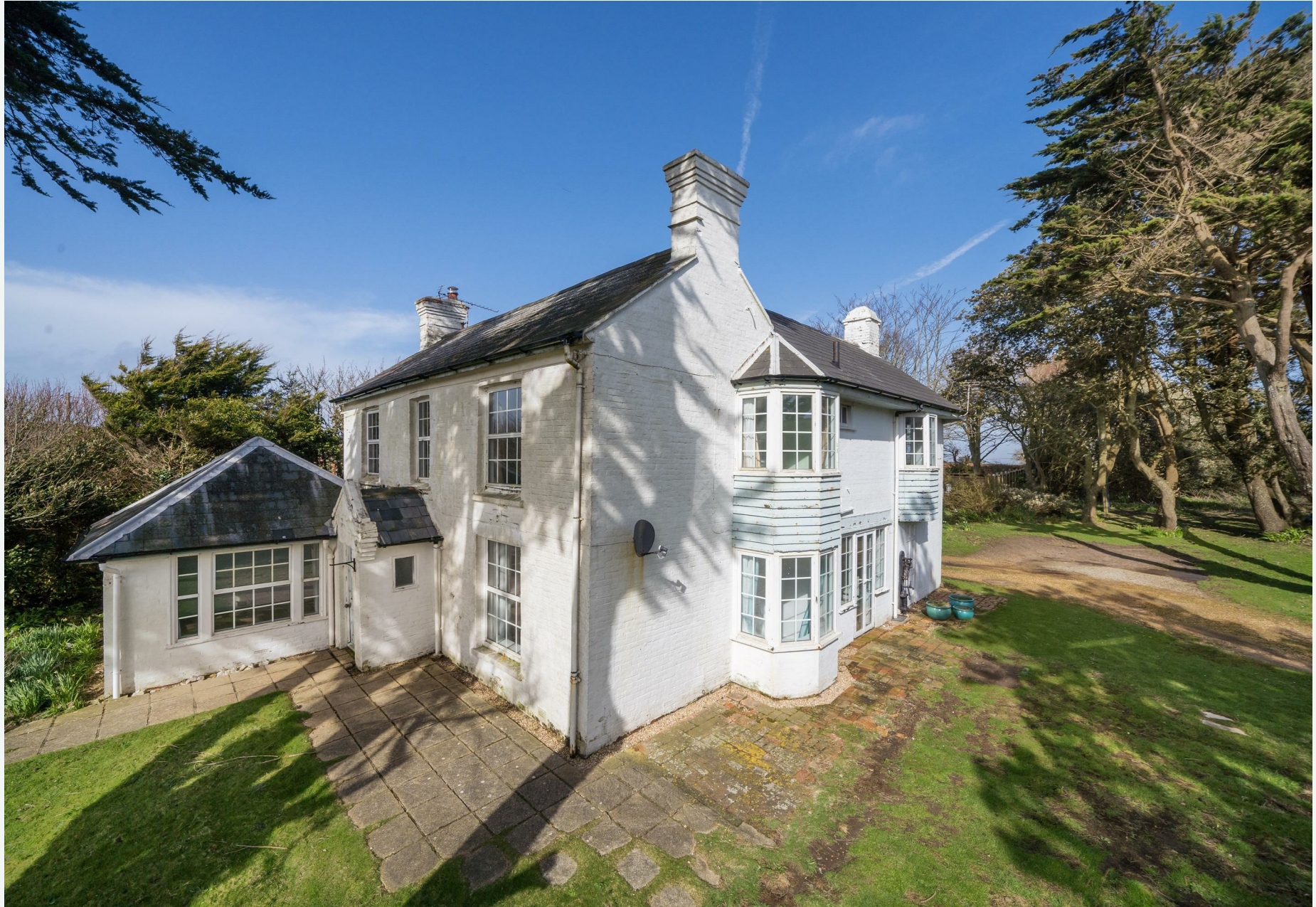
Alum Bay Cottage, Alum Bay, Isle of Wight