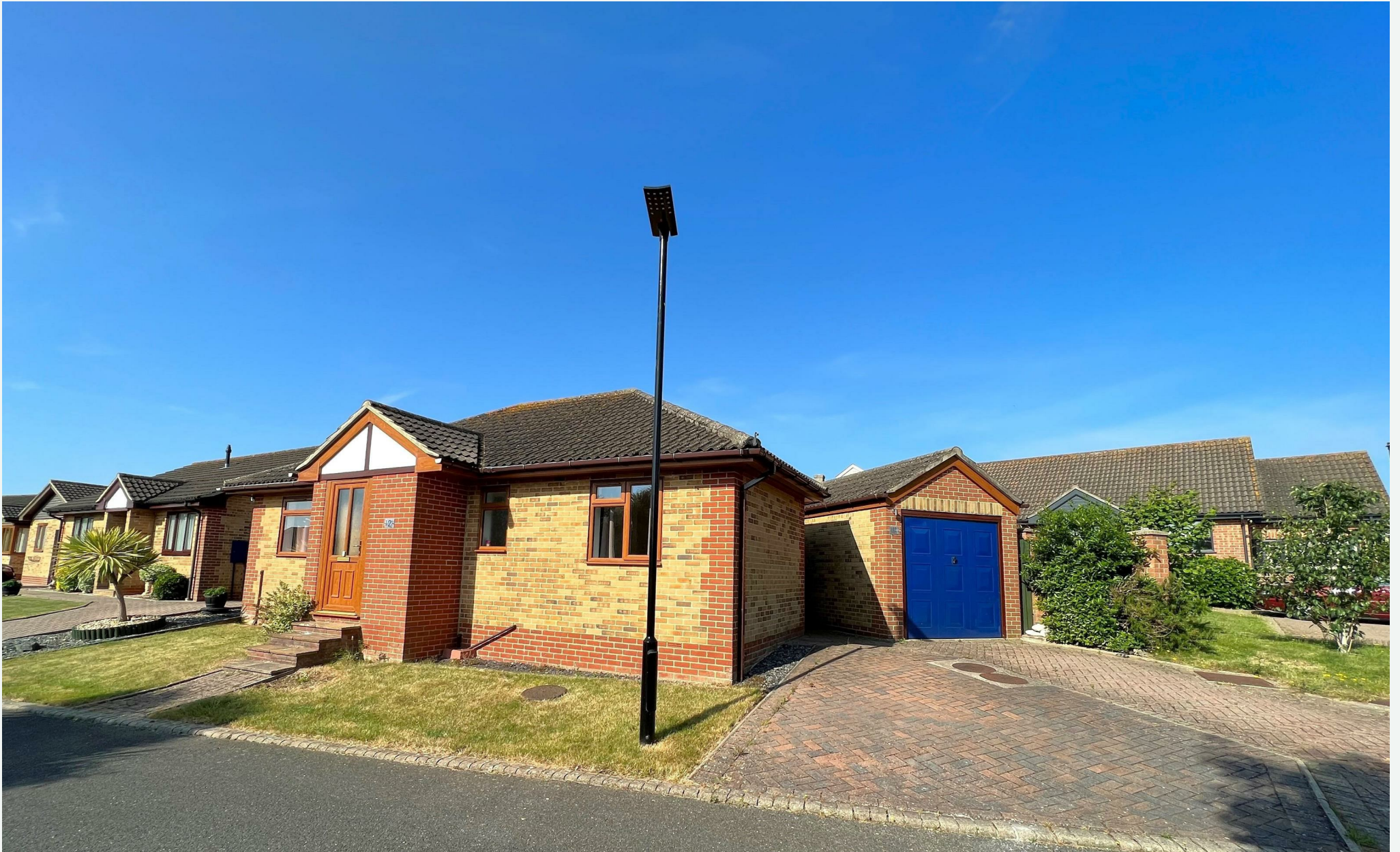
12 Jennings Close, Freshwater Bay, Isle of Wight