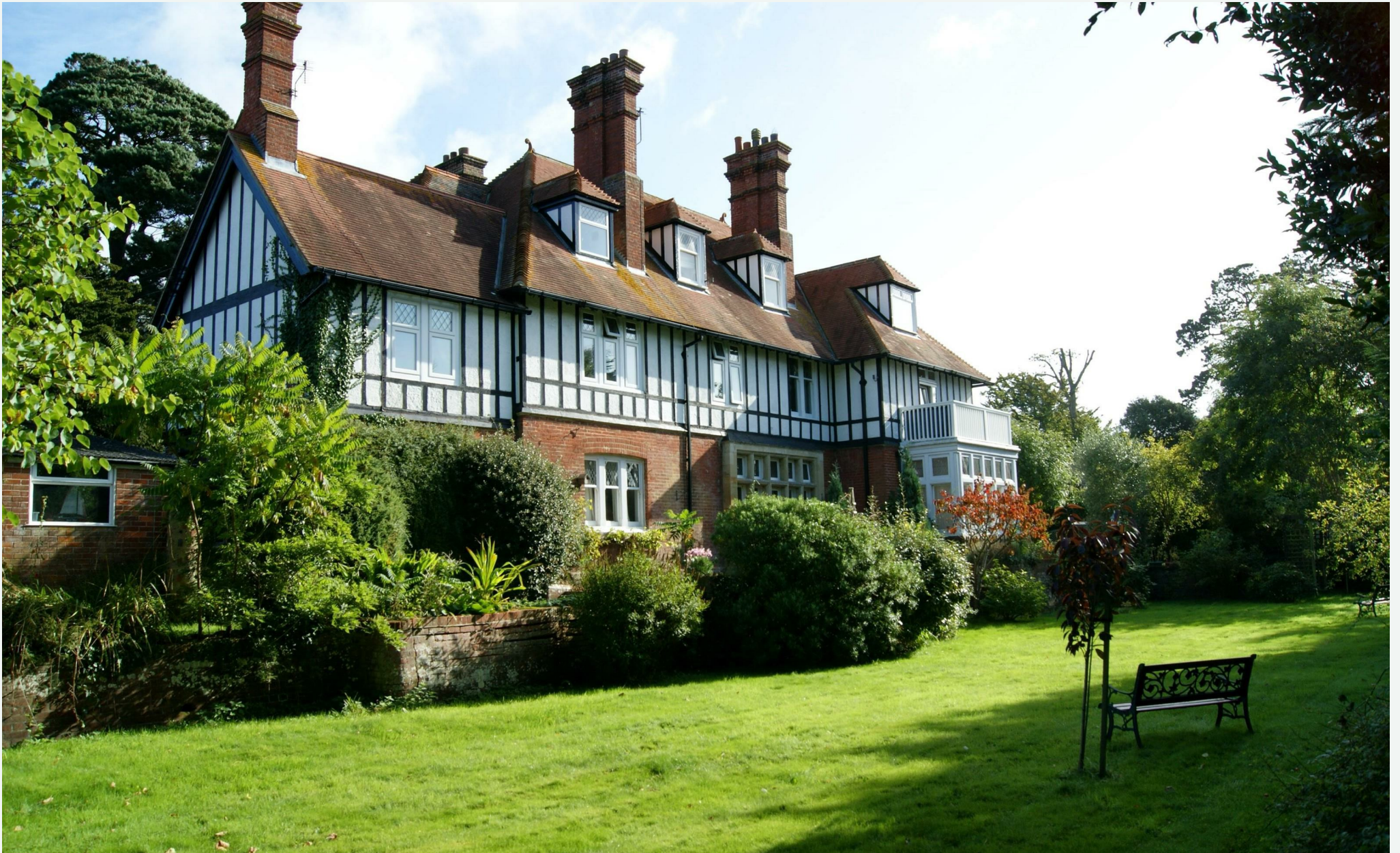
3 Afton Lodge, Afton Road, Freshwater Bay, Isle of Wight