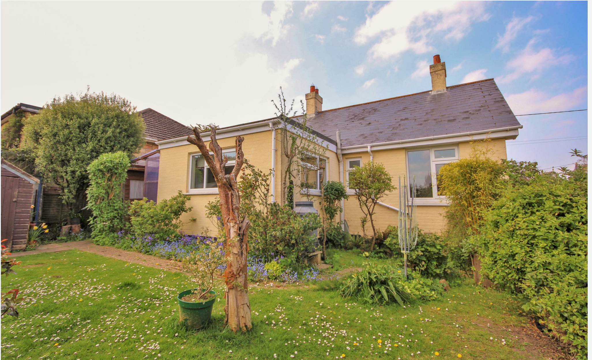
Castaway, Guyers Road, Freshwater, Isle of Wight, PO40 9QA