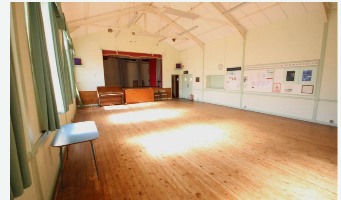
Freshwater United Reformed Church, Guyers Road, Freshwater Bay, Isle of Wight