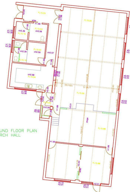
GROUND FLOOR PLAN CHURCH HALL

An exciting opportunity to purchase a former Church set in good grounds together with a sizeable Community Hall to the rear.