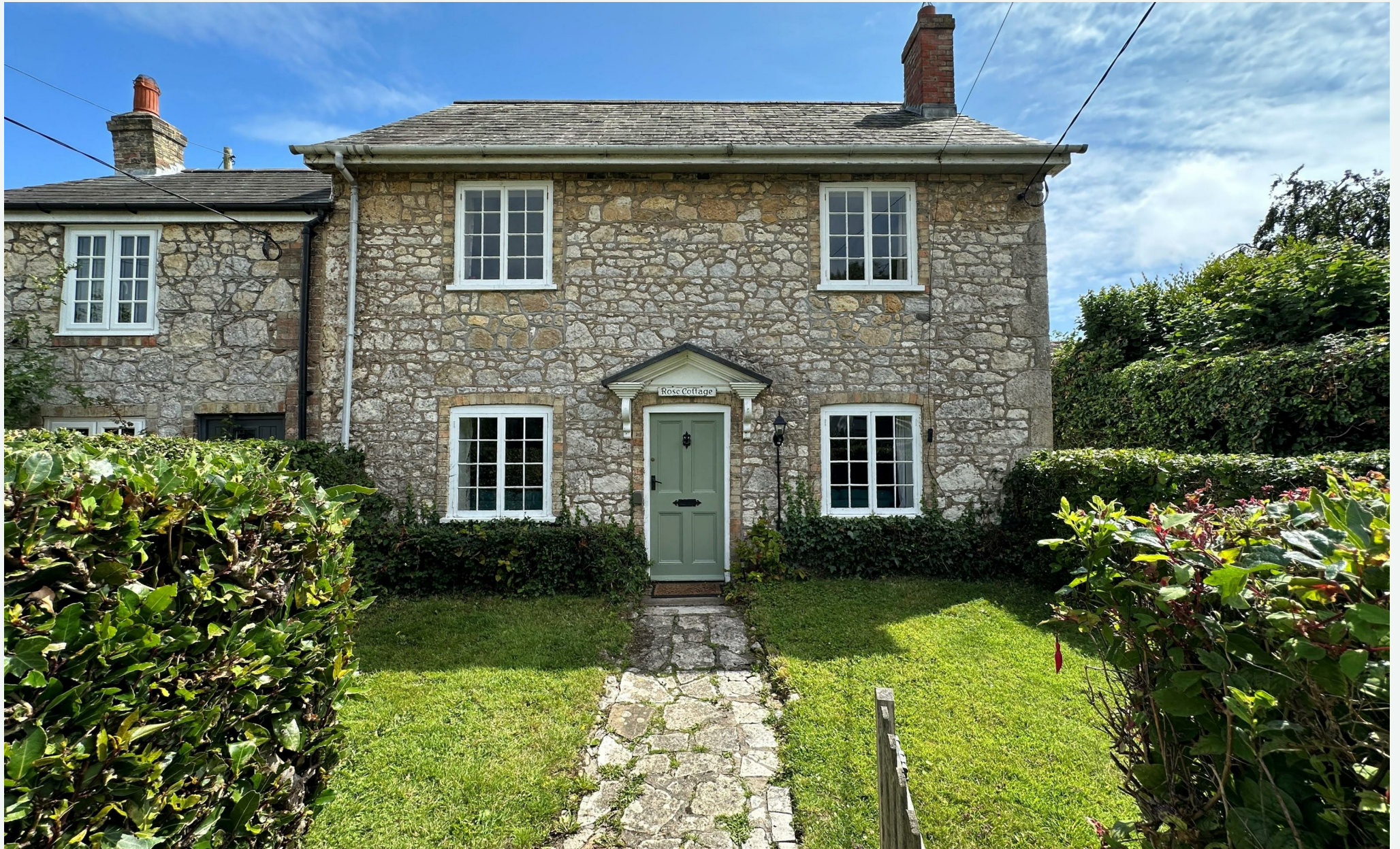
Rose Cottage, Norton Green, Isle of Wight, PO40 9RX