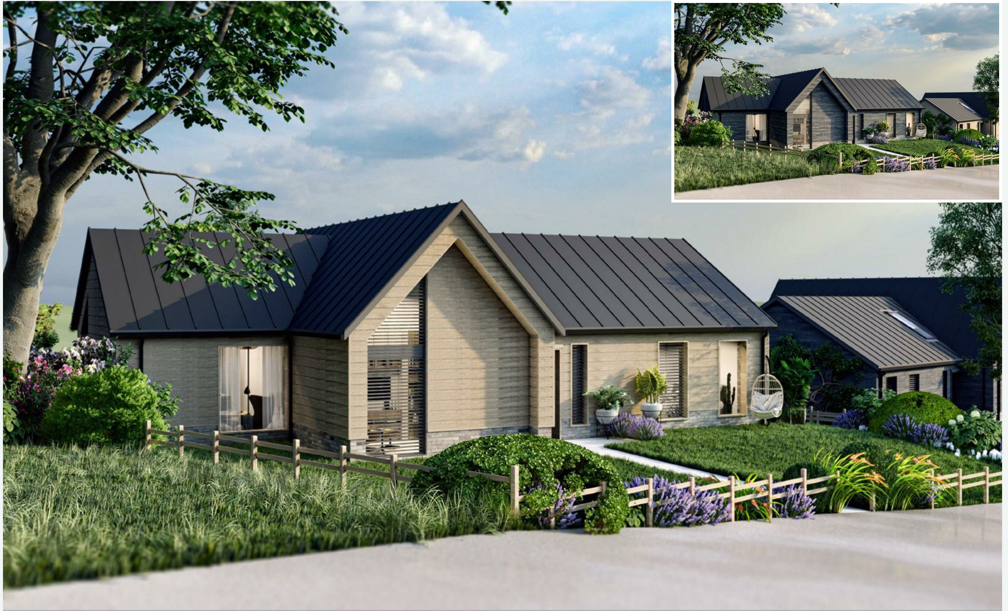
Plot 9 Hunnyhill Farm, Hunnyhill, Brighstone, Isle of Wight