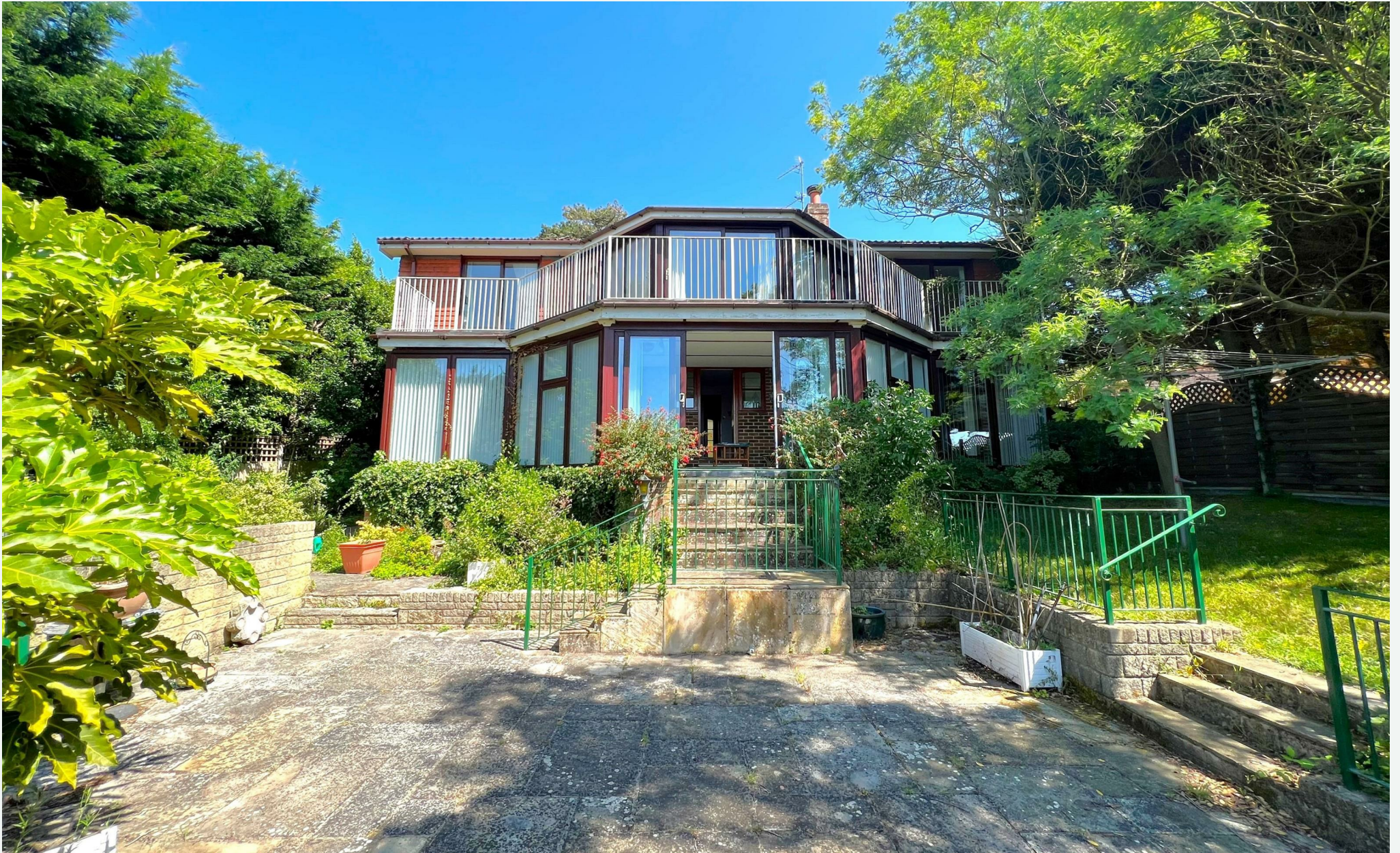
Solent Vista, Heatherwood Park Road, Totland Bay, Isle of Wight