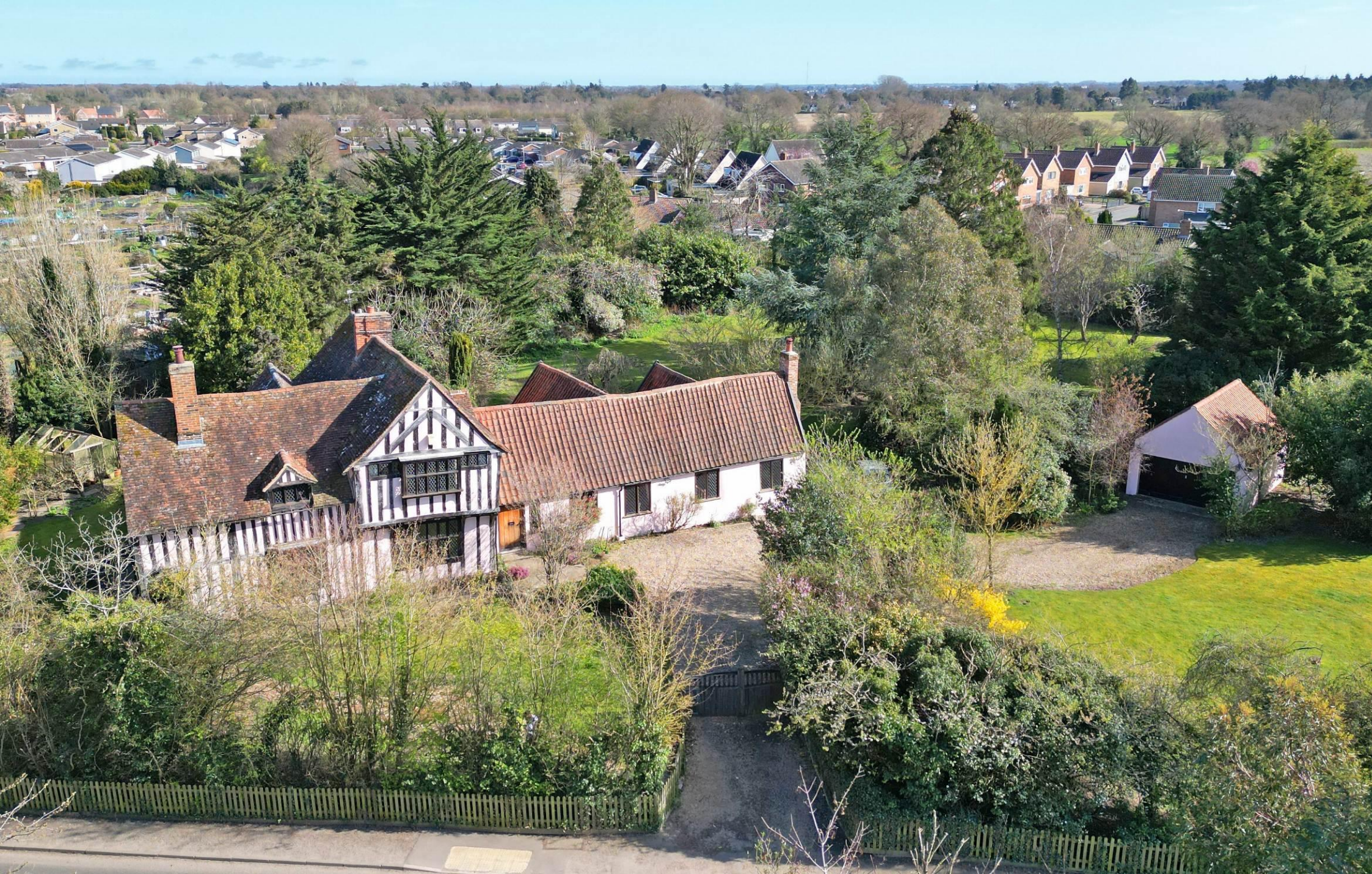
Chaplins, Heath Road, Colchester, Suffolk, CO7 6RA - Asking Price Of £1,495,000