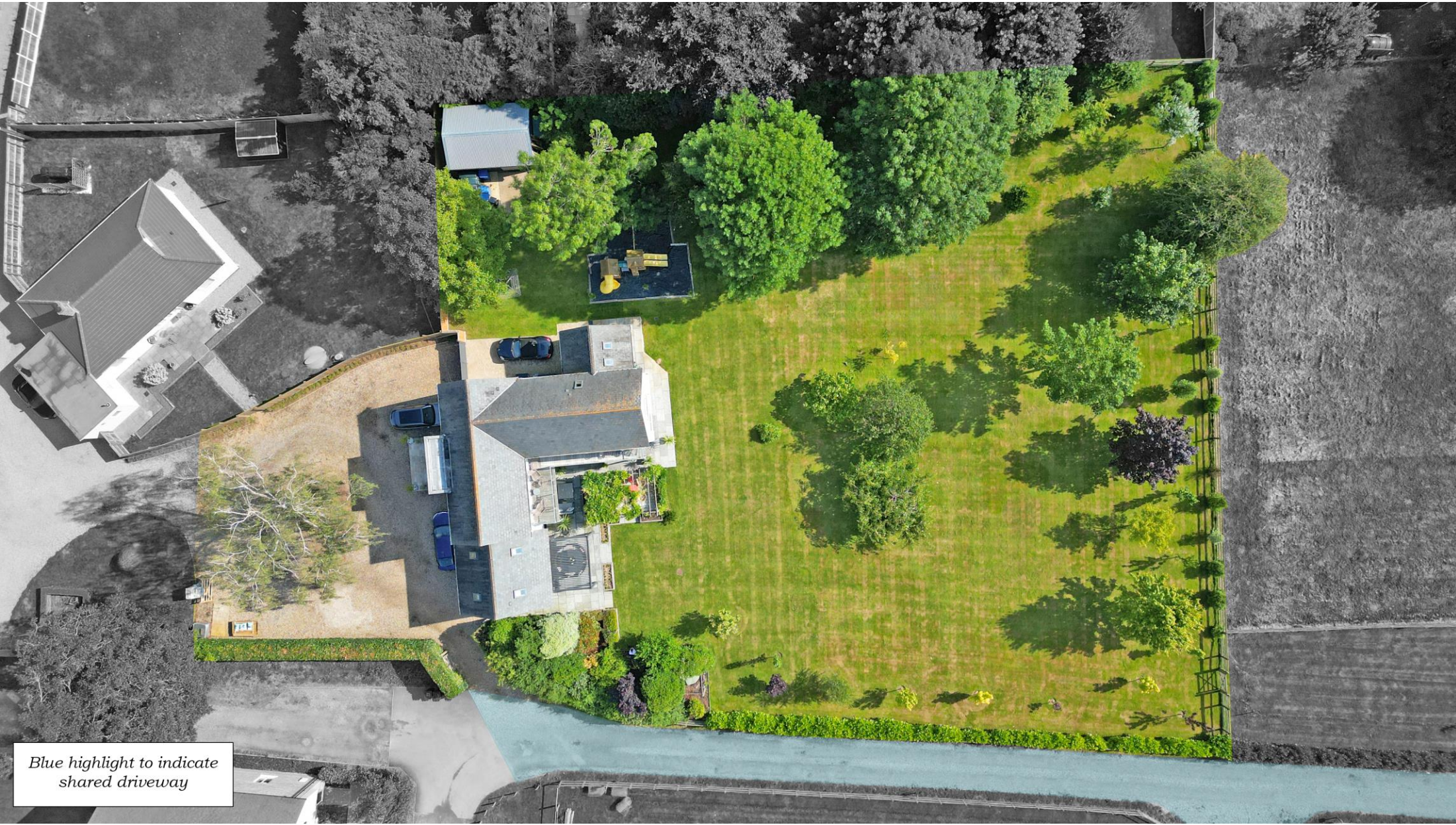
Blue highlight to indicate shared driveway