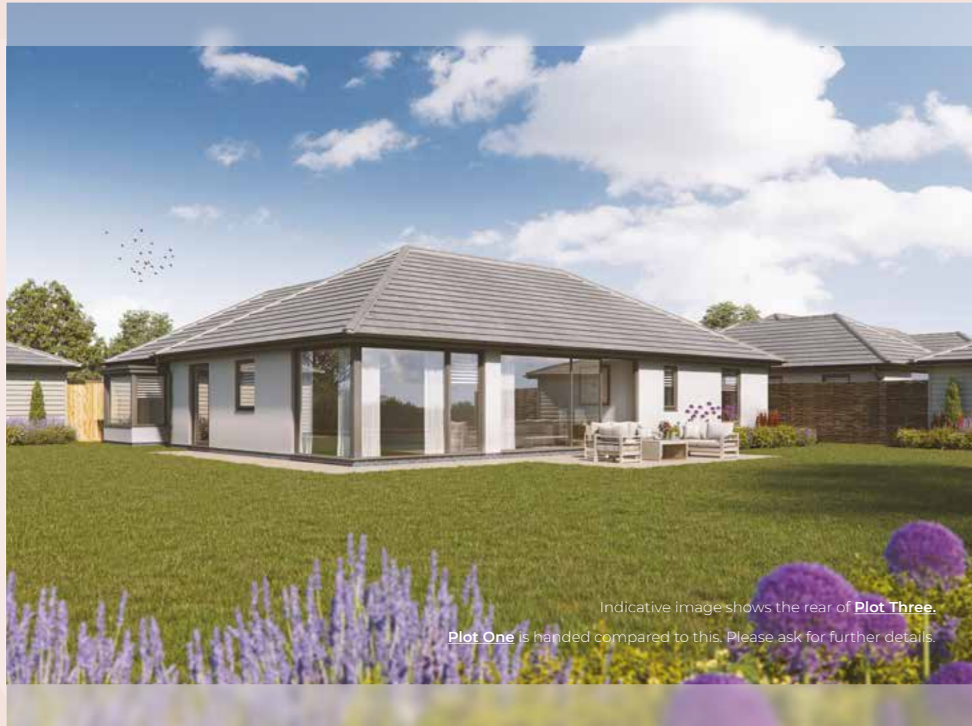
Indicative image shows the rear of Plot Three . Plot One is handed compared to this. Please ask for further details.