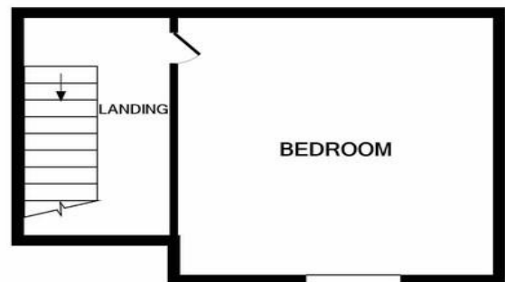
2ND FLOOR APPROX. FLOOR AREA 222 SQ.FT. (20.7 SQ.M.)

BANBURY STREET TOTAL APPROX. FLOOR AREA 1429 SQ.FT. (132.7 SQ.M.)