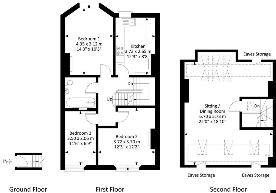
Illustration for identification purposes only, measurements and approximate, not to scale.

Approximate Gross Internal Area = 98.71 sq m / 1062.50 sq ft