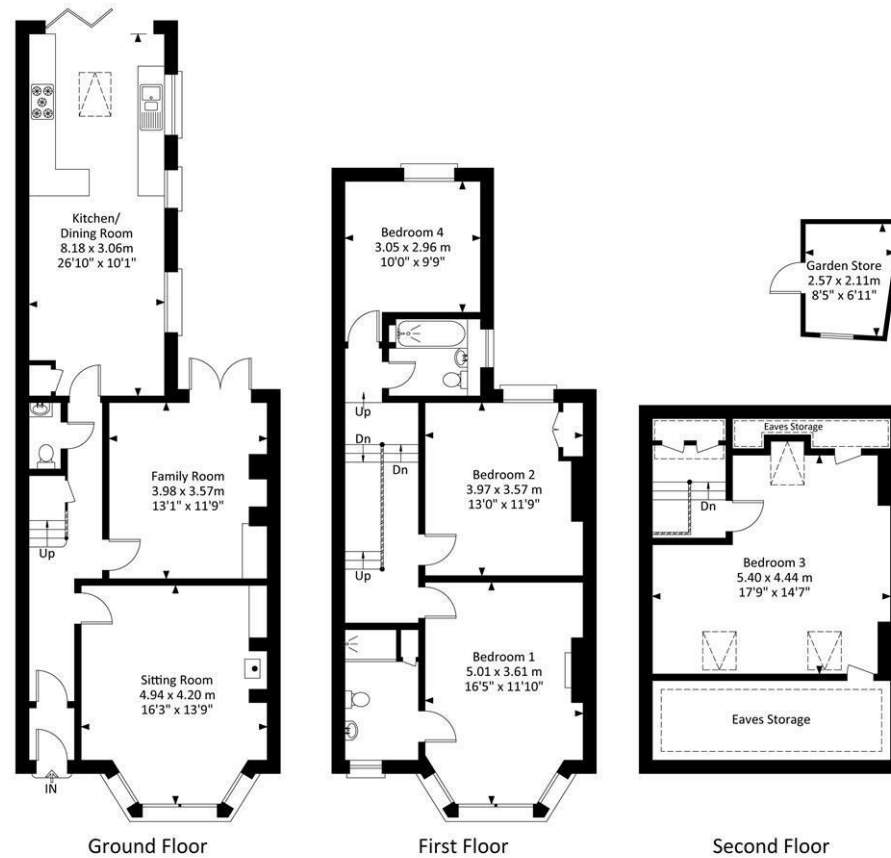
Illustration for identification purposes only, measurements and approximate, not to scale.

Disclaimer: You may download, store and use the material for your own personal use and research. You may not republish, retransmit, redistribute or otherwise make the material available to any party or make the same available on any website, online service or bulletin board of your own or of any other party or make the same available in hard copy or in any other media without the website owner's express prior written consent. The website owner's copyright must remain on all reproductions of material taken from this website.